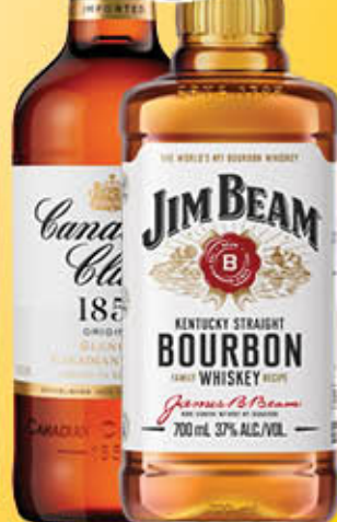
CANADIAN CLUB JIM BEAM WHITE LBL