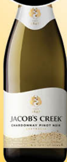
JACOBS CK SPARKLING