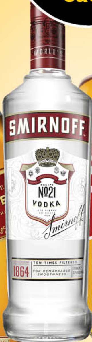
SMIRNOFF VODKA RED