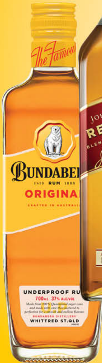
BUNDY UP RUM