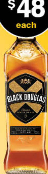
BLACK DOUGLAS SCOTCH