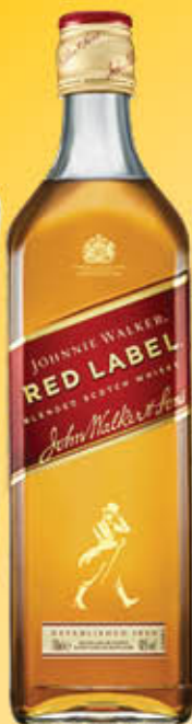
J/WALKER RED LBL