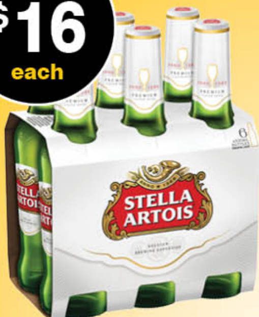
STELLA ARTOIS BTL 6PK