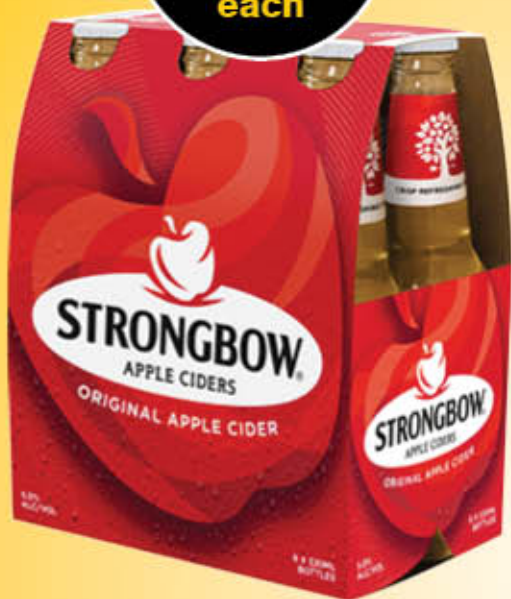
STRONGBOW CIDER BTL 6PK