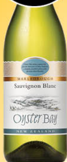
OYSTER BAY VAR