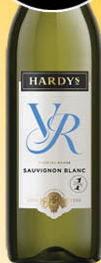
HARDYS VR VAR