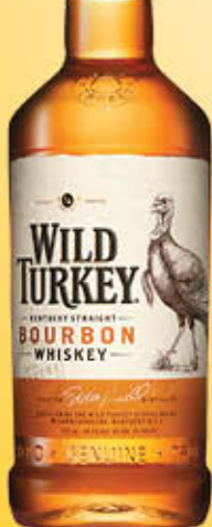
WILD TURKEY 81 PROOF 40.5%