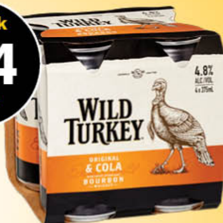
WILD TURKEY & COLA CAN 4PK