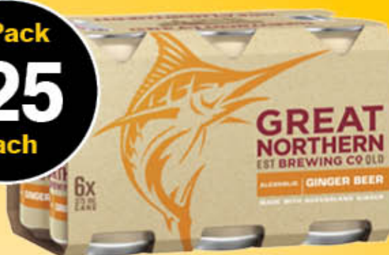
GRT NTH GINGER BEER CAN 6PK