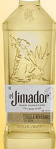
EL JIMADOR TEQUILA RESPOS