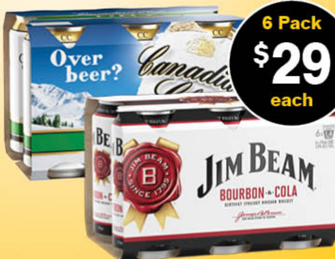
CAN CLUB & DRY 6PK CAN JIM BEAM & COLA 6PK CAN