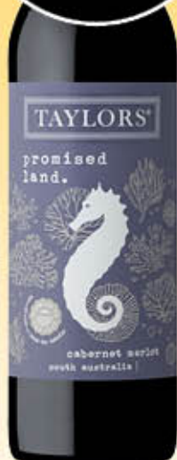
TAYLORS PROM LAND