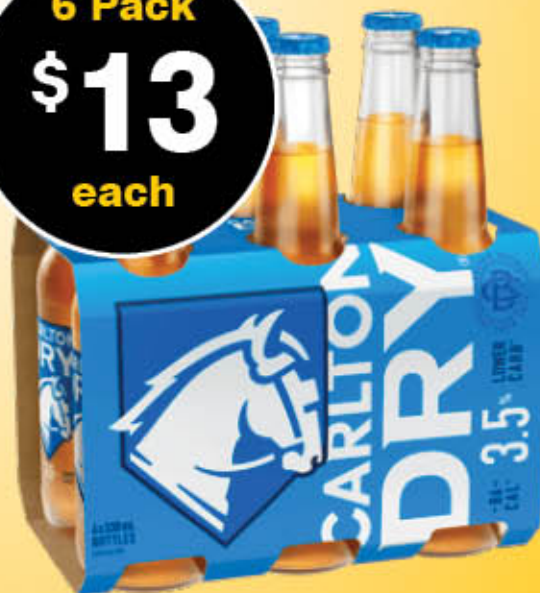
CARLTON DRY MID 3.5% BTL 6PK