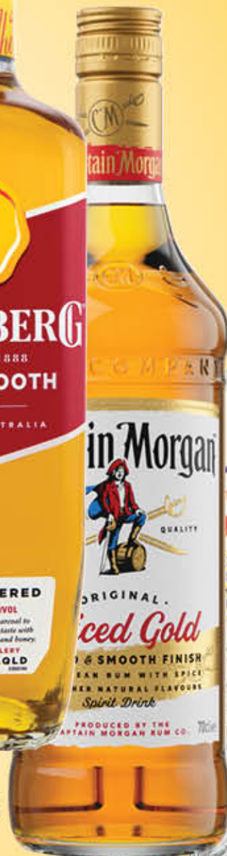
CAPT MORGAN SPICED GOLD