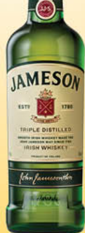
JAMESON IRISH WSKY