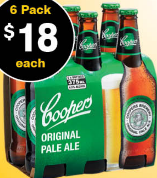
COOPERS PALE ALE BTL 6PK