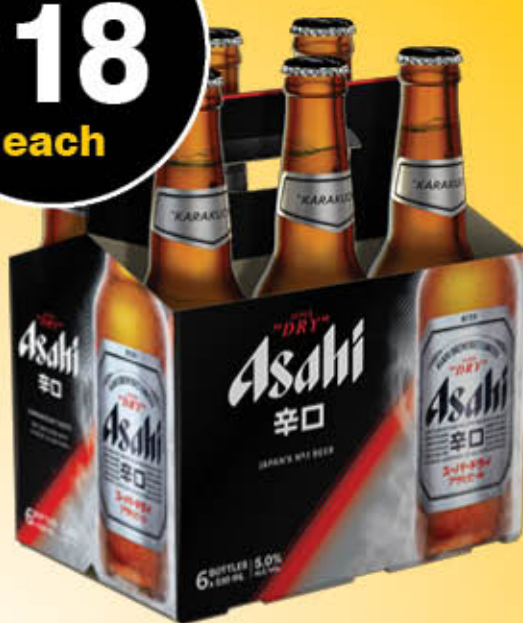
ASAHI SUPER DRY BTL 6PK