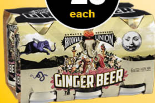
BROOKVALE RTD CAN 6PK