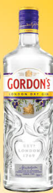
GORDONS DRY GIN