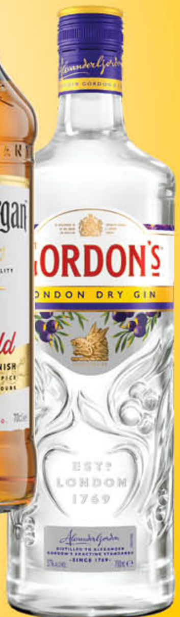
GORDONS DRY GIN