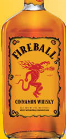
FIREBALL CINNAMON WHISKY