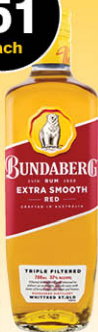
BUNDY RUM RED