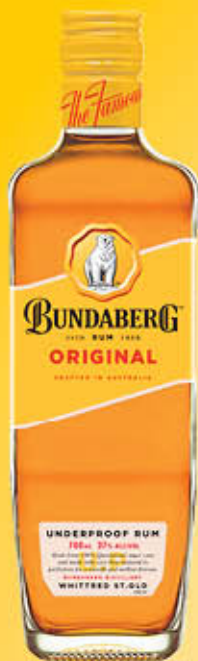
BUNDY UP RUM