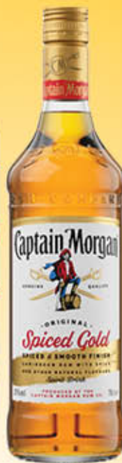
CAPT MORGAN SPICED GOLD