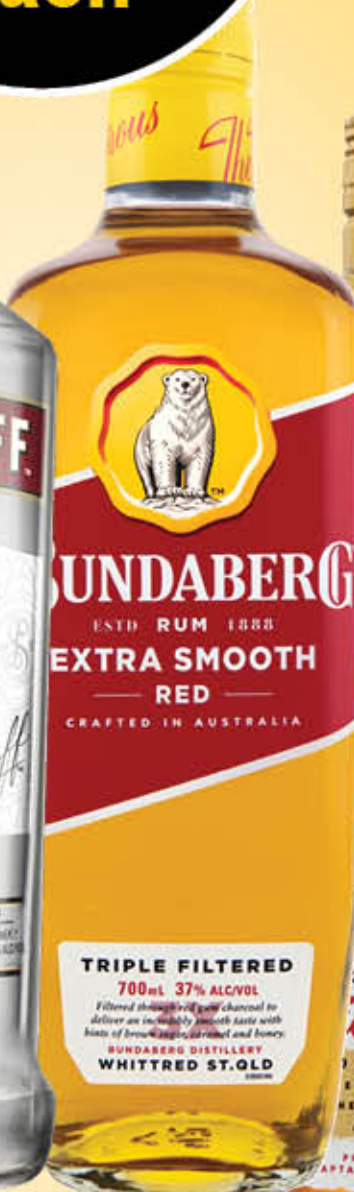
BUNDY RUM RED