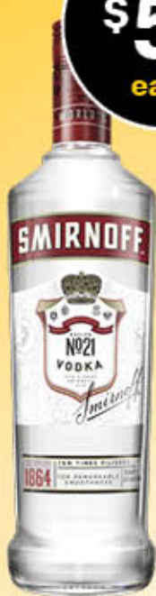
SMIRNOFF VODKA RED