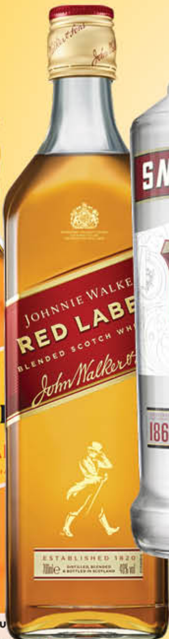
J/WALKER RED LBL